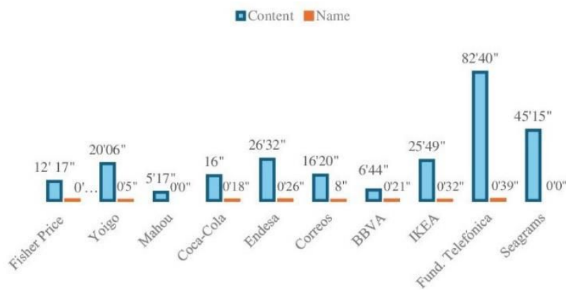
Figure 2. Temporary presence of the named brand in the podcast episodes.

There is a low temporal presence of the brand names over the total content length (Figure 2). In 2 of the 10 study cases, the brand producing the content is not named. These are the paradoxical cases of Mahou's Sonido Morse podcast and Seagram's ¿Quién decide? podcast, which, despite being an audio format, only uses the visual support to inform of its advertising nature in the episode covers.