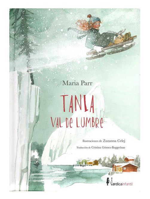
Image 2. The cover of the Spanish edition of Maria Parr's Tonje Glimmerdal illustrated by Zuzanna Celej. (Reproduced with permission from Nórdica Libros)

This is also suggested by the maps included in the endpapers. Celej's map echoes Irgens' map: a map of the valley where the main character lives, a rural place in between the city and the wilderness (Parr, Tania 82). However, the Spanish map is in color and reminiscent of postcards. In addition, snow plays a more central role here than in Irgens' map, and the geographical elements are less noticeable and more difficult to position. In the Norwegian map, on the other hand, there are no decorative elements such as trees scattered eve-