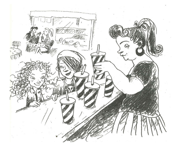
Image 5. Tonje and Ole at a café in town (Parr, Tonje Glimmerdal 161).

In addition, chapter 7 includes another traditional Norwegian element: a troll (Parr, Tania 59). More specifically, this picture represents the Norwegian fairy tale "Three Billy Goats Gruff" that is explained in the novel. It may have been included because trolls are part of the idyllic, even fantastic, Norwegian landscape that is presented in the Spanish illustrations (see image 6).