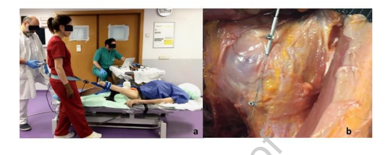
Figure 1: Experimental set-up. a) Long-axis distraction mobilization, b) The strain gauge inserted into the inferior ilio-femoral ligament.