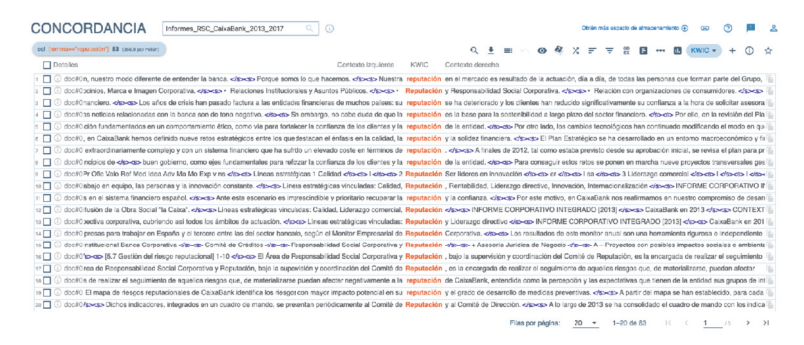
Figure 3. Concordance of the keyword reputación.

The first example is reputación ("reputation") the second-most frequent keyword from the 2013-2017 reports. In addition to the concordance for this word (Fig. 3), we also considered those of morphologically related words, such as the adjective reputacional.