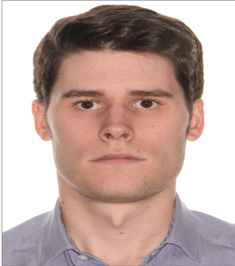
Figure 3: Frontal 2D photograph in resting position.