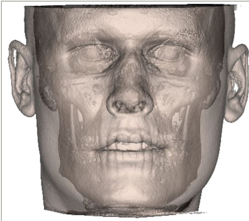
Figure 1: A CBCT scan is taken with the patient breathing quietly, sitting upright in natural head position, the tongue is in a relaxed position, and the mandible is in centric relation with a 2 mm wax bite in place in order to avoid direct tooth contact.

Communication) and exported to a specific software (Dolphin® 3D Orthognathic Surgery Planning Software Version 11.8, Chatsworth, California, USA), in which DICOM files are segmented and processed in order to obtain a 'clean' 3D representation, which is then stored as an STL file. Afterwards, surface scanning of both dental arches is achieved with the Lava Scan ST scanner (3M ESPE, Ann Arbor, MI, USA), thereby producing another STL file (Figure 2). Finally, a frontal 2D photograph in resting position is taken (Figure 3). The three STL files are fused (Figure 4) using the Dolphin® software with a "best fit" algorithm. The system uses surface-based rigid registration using ICP (iterative closest point) in order to minimize rotational and translational differences between the three datasets (Figure 5).