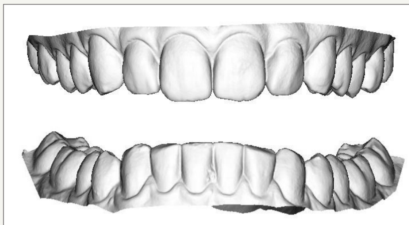
Figure 2: Surface intraoral scanning of both dental arches.