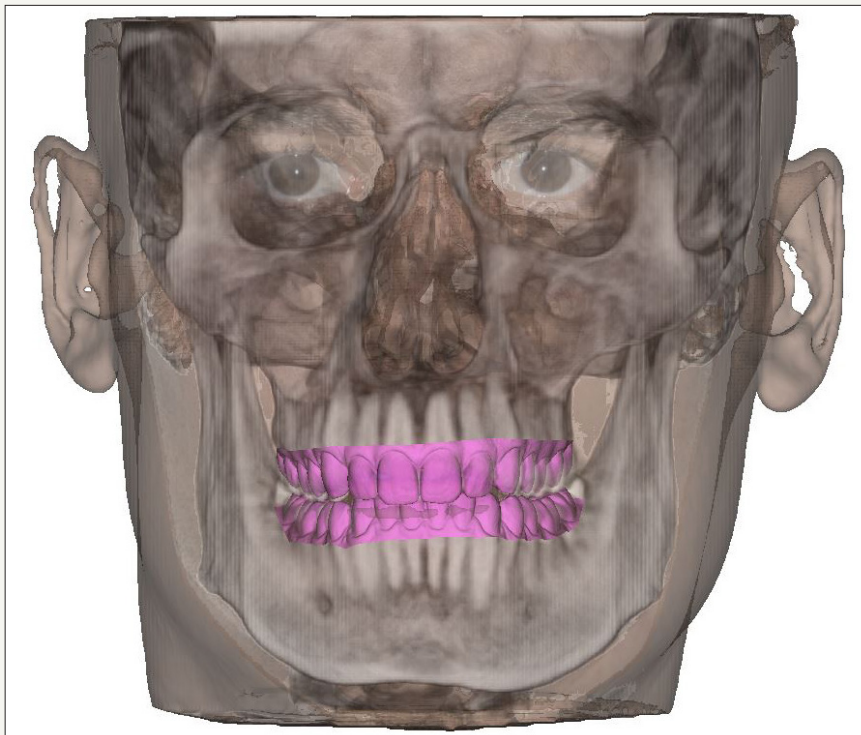
Figure 4: "Facial-print" or "virtual patient".