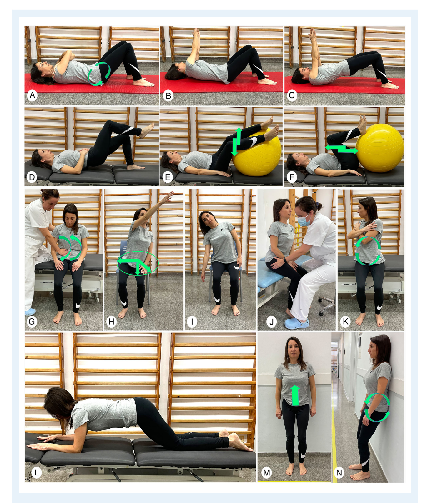
Figure 1. Core stability exercises program: (A) Lumbopelvic anteversion + retroversion (B) Upper trunk rotation (C) Bridging (D) Unilateral bridging (E) Lower limbs rotation (F) Knee-hip flexion-extension (G) Trunk flexion-extension (H) Reaching in three directions (forward, ipsilateral, contralateral) (I) Trunk lateral inclination (J) Lift hemipelvis (K) Upper trunk rotation, (L) Modified Plank (M, N) Lumbopelvic anteversion + retroversion.