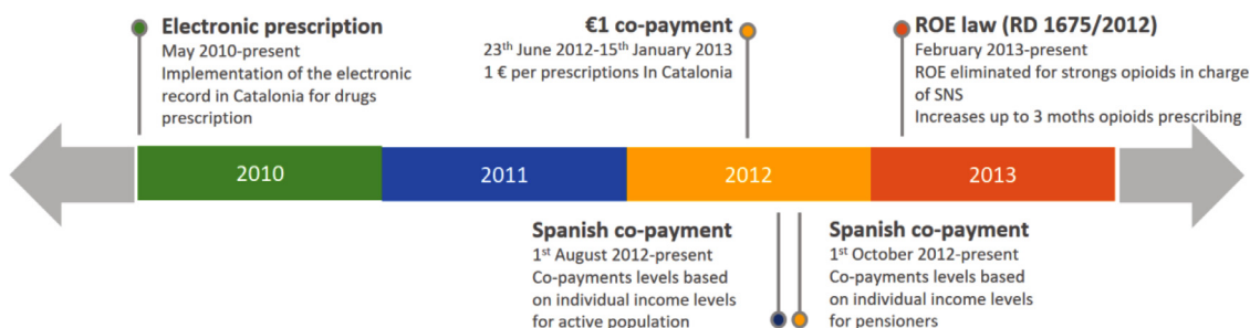
Fig. 1. Timeline of regulations in the drug management system in Catalonia during the period 2012–2013.