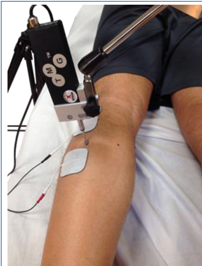
Figure 1: TMG procedure.

0.85-0.98) [13-16]. By the TMG, it can be measured the followings parameters (Figure 2 and Table 1)