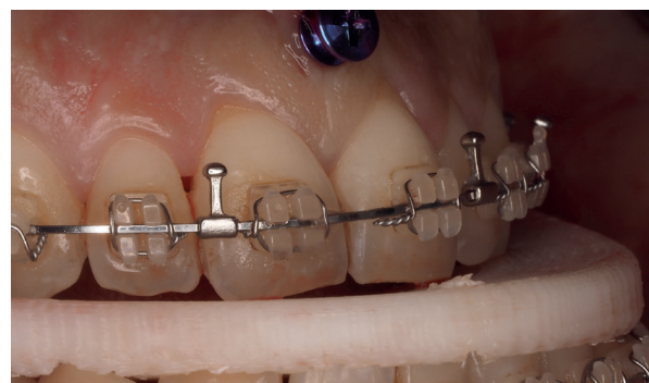
Table 2: Lack of complete penetration of the anterior teeth into the intermediate splint and vertical balancing movement after conventional fixation.

All patients were operated upon under general anesthesia by the same surgeon (FHA) according to the mandible first protocol. Once bilateral sagittal split osteotomy was performed, the intermediate splint was placed between the dental arches, and intermaxillary fixation was achieved with 0.12 mm wires. In all cases the intermediate splint presented vertical balancing movement and anteroposterior instability, making it impossible to achieve complete penetration of the anterior teeth into the splint (Fig. 2).