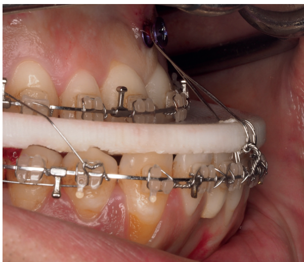
Table 3: Fixation of the intermediate splint to the upper screw and to the lower arch with two extra wires improves intermediate splint accuracy.

In order to allow full stability and dental penetration into the intermediate splint, an intermaxillary fixation (IMF) screw (2x9 mm) was placed in the maxilla between the central incisors at the upper level of the mucogingival junction, avoiding damage to the roots of the neighboring teeth. The authors recommend not introducing the screw completely, so that the head of the screw is at the same level as the edge of the surgical splint in order to assure a vertical traction and a complete penetration of the teeth into the splint. Then, a tunnel was made in the central area of the most anterior aspect of the intermediate splint using a fissure burr, following the direction of the sagittal maxillo-mandibular discrepancy, and then the intermediate splint was fixed to the screw and to the lower arch with two extra wires (Fig. 3).