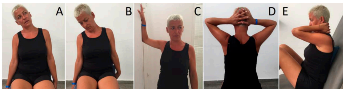
Figure 1. Conventional physical therapy treatment. (A) Stretching of the upper trapezius muscle; (B) stretching of the elevator scapula muscle; (C) stretching of the pectoralis major muscle; (D) cervical spine auto-traction; (E) thoracic spine auto-mobilization.