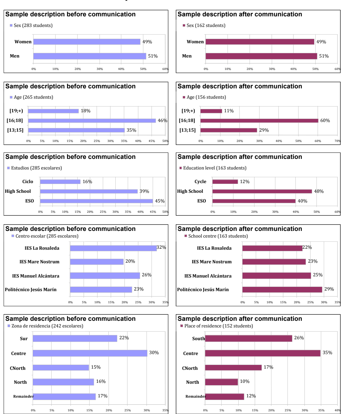
Appendix II: This section presents the results from the sample, both before and after the use of the communication techniques