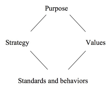
Figure 1. The Ashridge Mission Model

The Ashridge model is represented in the shape of a diamond, placing the 'purpose' as the main element and the 'standards and behaviors' as the foundation that supports the other two elements, strategy and values (see Figure 2). This model includes some of the elements defined by Pearce and Want, but introduces a new one: 'strategy', as part of the mission. This proposal can also be seen in other authors of their time, such as Klem et a. (1991) and Ireland and Hitt (1992).